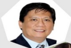
Former Chief of the PNP, Retired PGEN Archie Francisco F. Gamboa

April 9, 2021, Friday, 8:00-5:00p.m. Host: Rotary Club of Tagum North